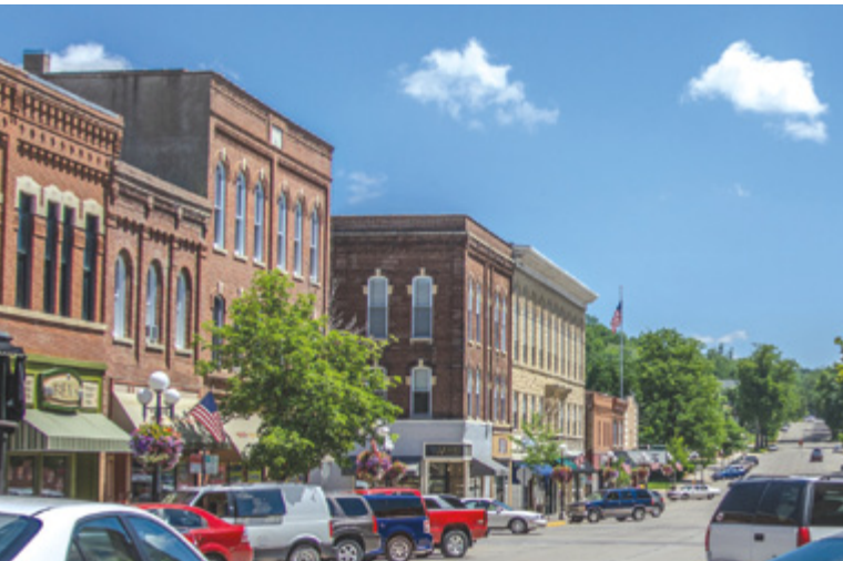
Bush Street in Historic Downtown Red Wing.