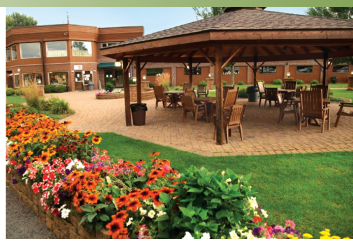
Stop by our beautiful Gazebo on summer Saturdays for burgers, brats, hot dogs, cold beer, rail drinks and socializing.

Saturday, August 8, 5 - 7 p.m. barbecue, 7 - 9 p.m. entertainment Gather with us on the Clubhouse grounds for late summer barbecue and an evening of comedy. Minibar open throughout the evening.