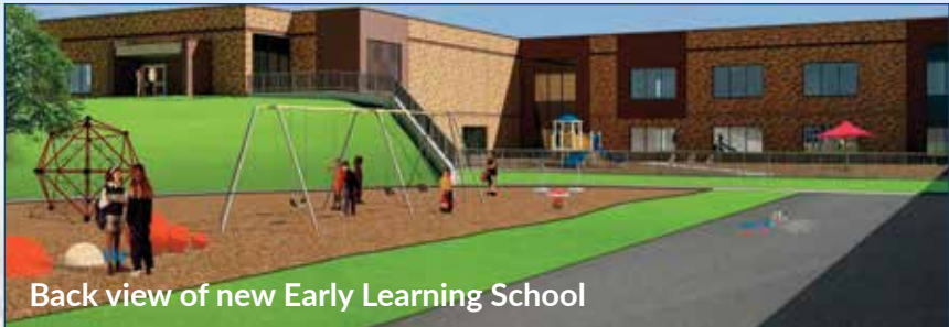
Back view of new Early Learning School