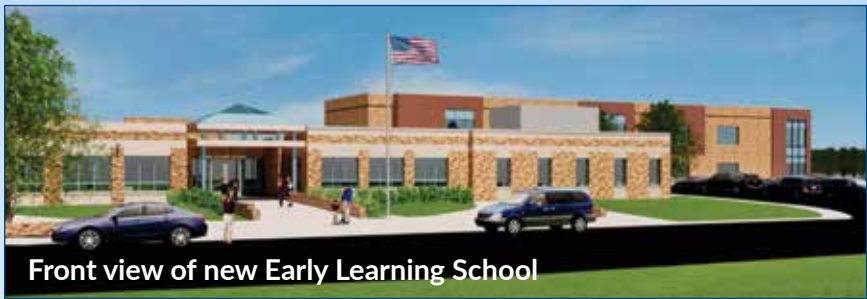
Front view of new Early Learning School